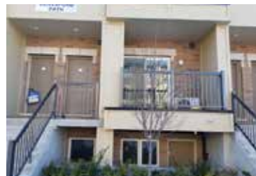
New 2 Bedroom for Lease