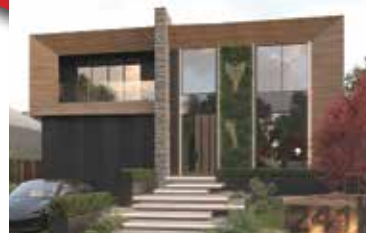
Net Zero Pre-construction Sale!

905.655.7236 view 1000's of Homes for sale at KingHomeTeam.com or KingOfBrooklin.com