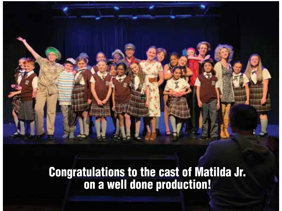
Congratulations to the cast of Matilda Jr. on a well done production!

The self-service portal is part of the myDurham 311 initiative, a transformational project aimed at improving the customer experience at Durham Region.