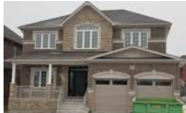
4 Bedroom For Sale!