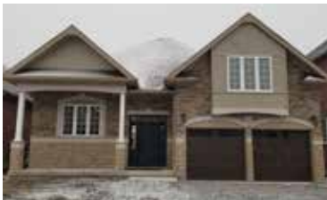
Bungalow For Sale!